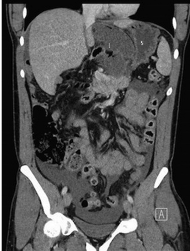
Figure 2. Jejunum Seen Herniating Through the Foramen of Winslow to the Lesser Sac, Displacing the Stomach Laterally (Coronal View)